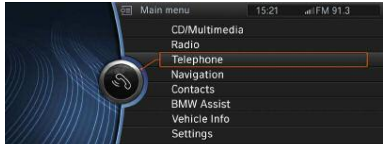
Central Information Display (CID)

In addition to this main menu, an arrangement of toggle switches for the most important menu items in the main menu is located in the immediate vicinity of the controller.